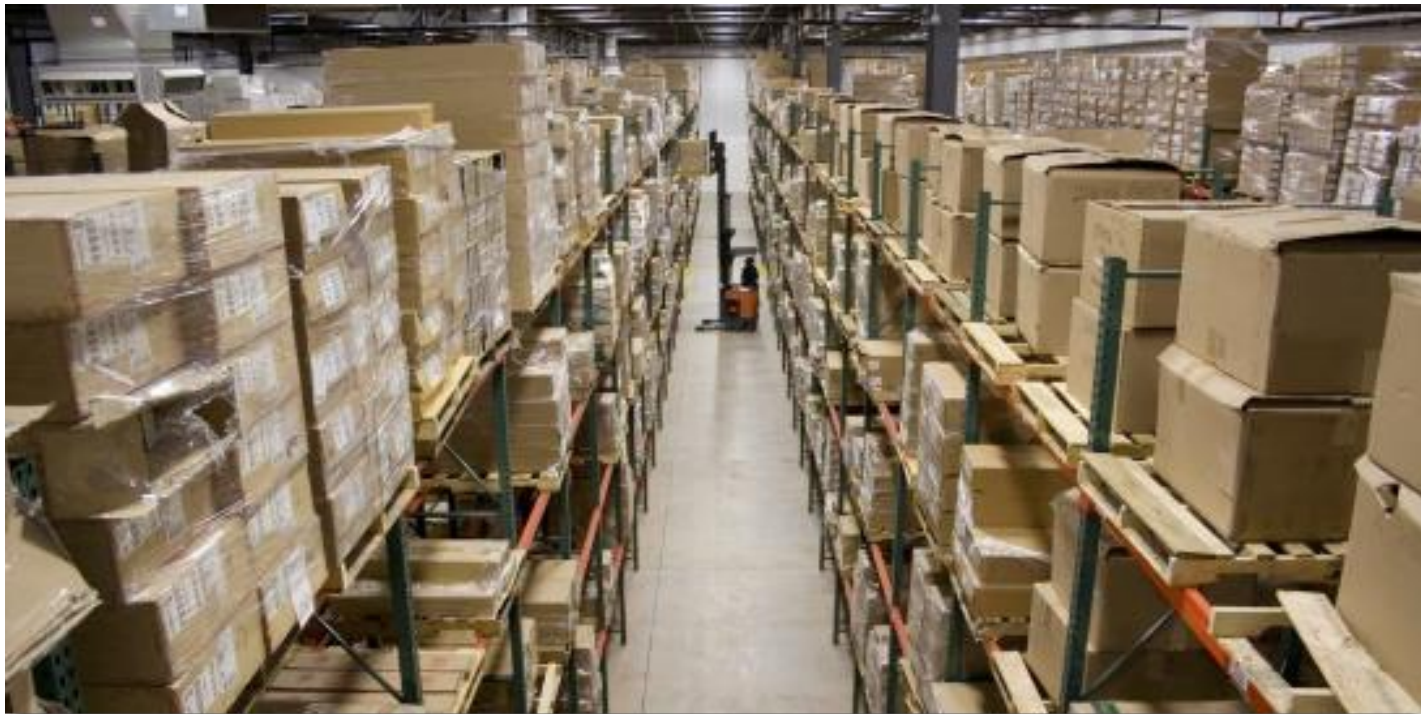
HADIMKOY WAREHOUSE, ISTANBUL - TURKEY

Our warehousing and distribution solutions are exclusively designed to ensure that your goods and products reach your customers as quickly, safely and smoothly as possible.